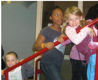
Boarding the plane... to check out what it's like to be a pilot.