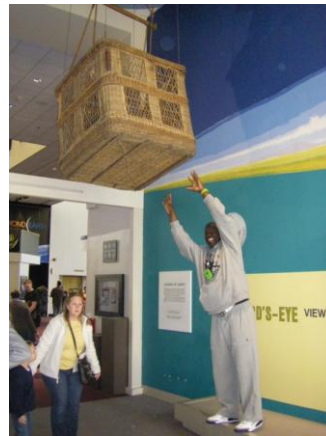
Glen learning that hot air lifts balloons up into the sky. The first hot air balloon passengers were animals: a sheep, a duck, and a hen. King Louis the XVI witnessed this flight - it was in 1783.